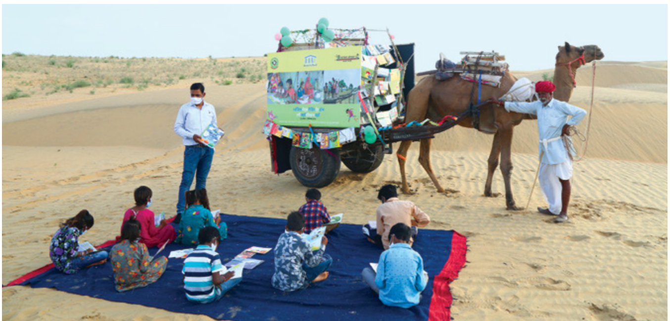
A 'camel cart' delivers books to children in India. This is just one innovative approach Room to Read used during the pandemic to ensure continued learning.