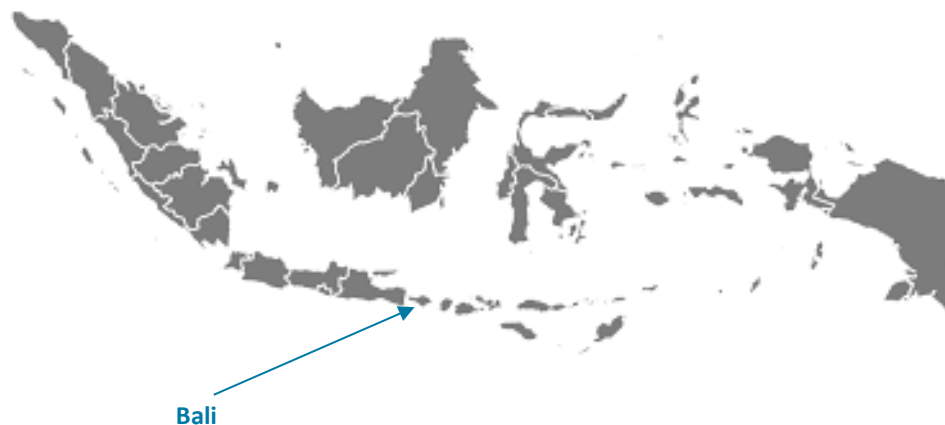
Map: Indonesian Islands

Indonesia is the fourth most populous country in the world, consisting of 17,000 islands, as well as urban, rural and remote regions, diverse cultures and more than 700 living languages.